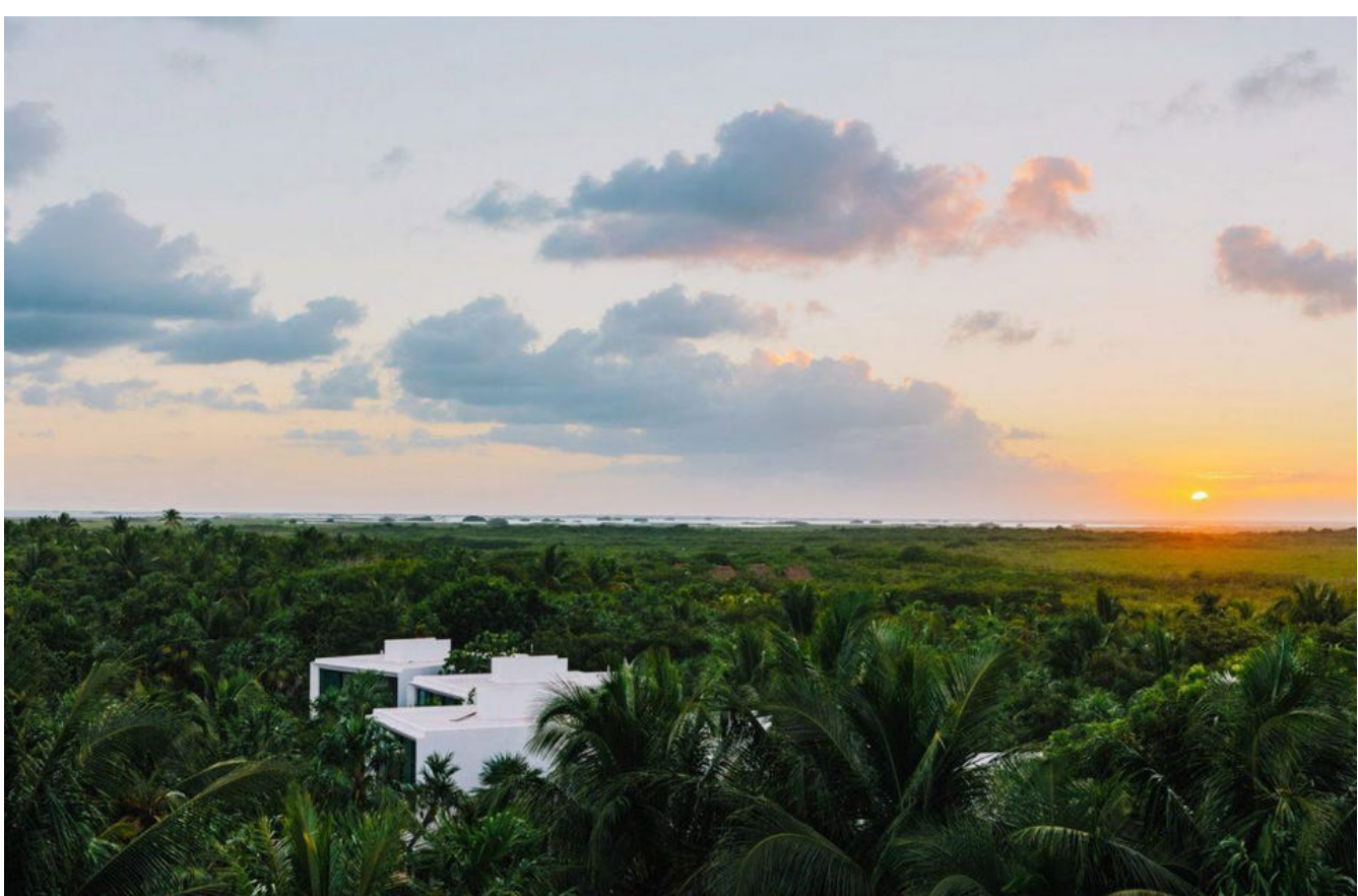
Casa Malca sits just south of Tulum at the northern edge of the Sian Ka'an Biosphere Reserve, a ... [+]

Though design hotels are nothing new to those of us coming from New York or L.A., in the big-box resort-dominated atmosphere of Tulum, Casa Malca is a welcome addition. Whether you compare its feeling of seclusion to The Walled Tsingpu Yangzhou Retreat in China or its art collection to Chez Georges in Rio de Janeiro , there's plenty to get excited about when it comes to Casa Malca.