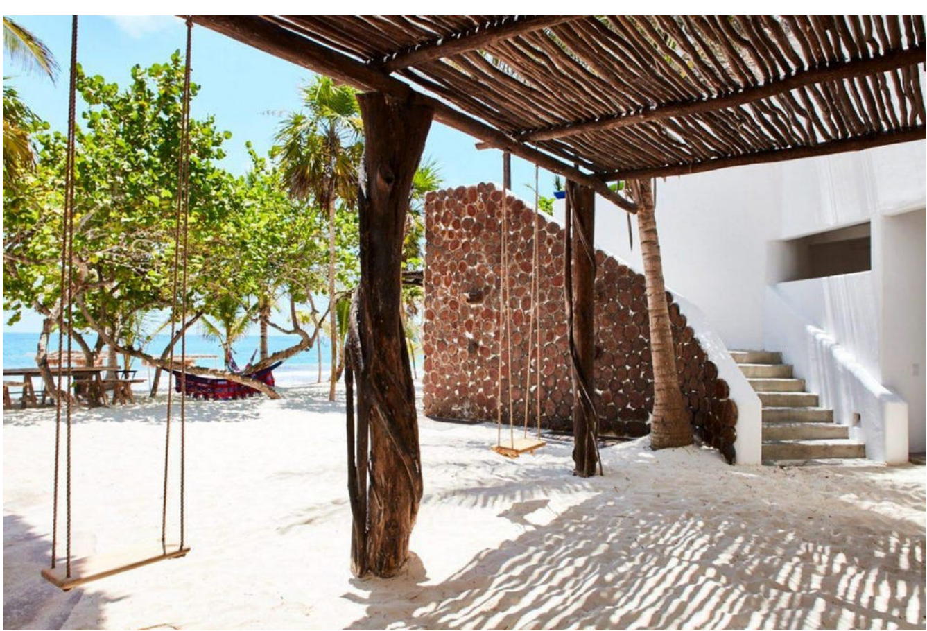
The overall ambiance at Casa Malca is that of a low-key beach house, the friend's place that always ... [+]

Casa Malca features 42 rooms, each of them mere steps from the resort's wide, white-sand beach. Rooms blend a neutral palette with regular shocks of color , from the deep emerald of the surrounding jungle to the bright azure of the ocean beyond. Full-height glass doors flood every room with natural light; washed concrete floors do not fear the sandy beach. Junior Suites are about 400 square feet with large terraces or direct beach access. Beachfront Master Suites offer 620 square feet of indoor space plus another 600 square feet on an outdoor private terrace, complete with hammock. Expect rainforest showers, Egyptian cotton linens and loads of art inside.