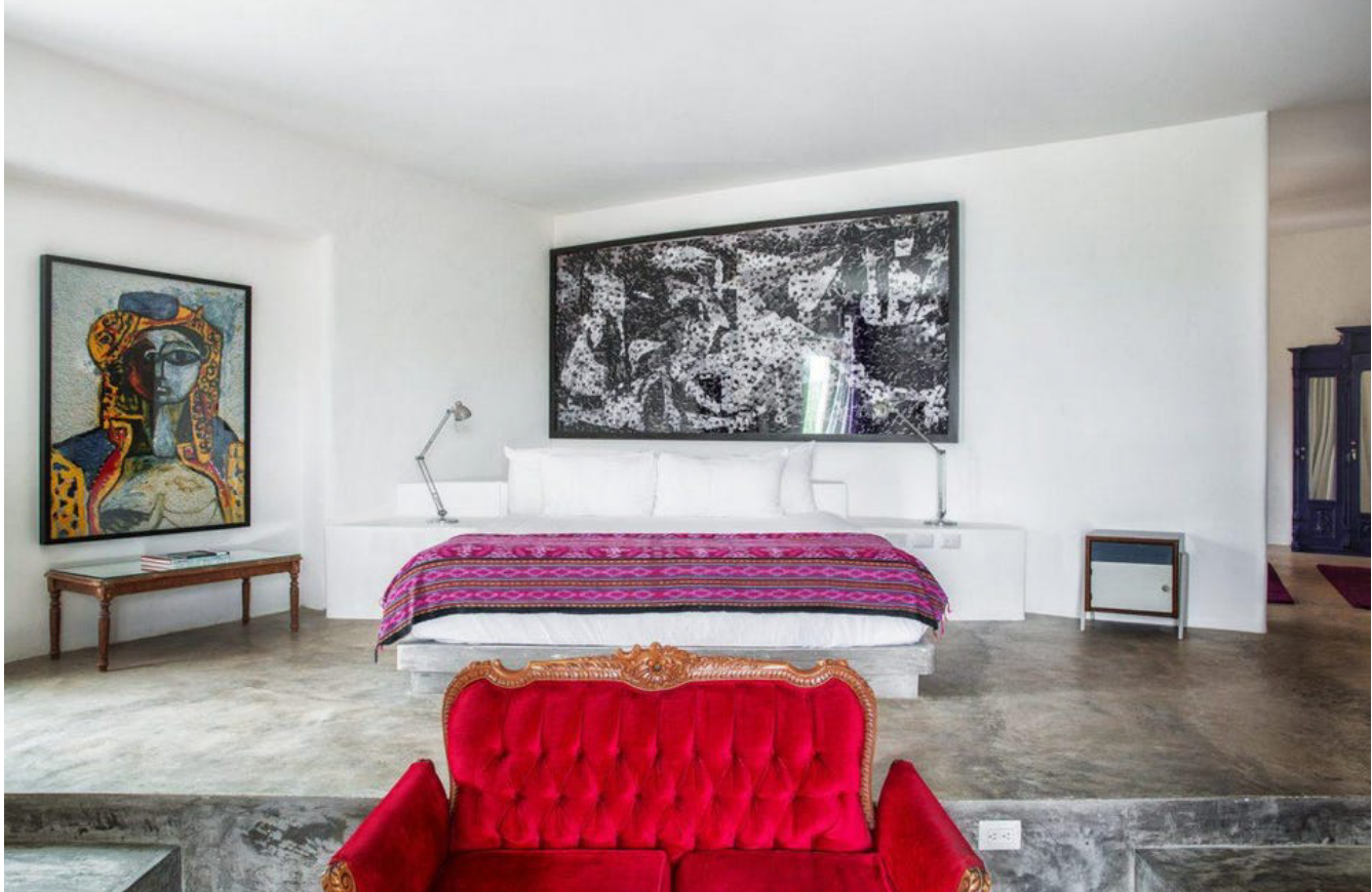
Casa Malca features 42 rooms, each of them mere steps from the resort's wide, white-sand beach. ... [+]